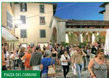
PIAZZA DEL COMUNE

Piazza Angelio and Piazza del Comune are the heart of the Historical Centre and are surrounded by Medici period buildings. Here you can find some popular bars and restaurants to spend a relaxing moment in Barga.