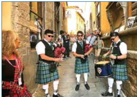
BARGA SCOTTISH FESTIVAL

This year the Festival will host the Isle of