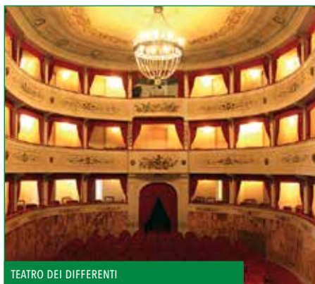
TEATRO DEI DIFFERENTI

Teatro dei Differenti was built in 1795 from a previous one of 1689. It is one of the best preserved and most prestigious theatre of its size in Tuscany. Every year it hosts an important theatrical season and Opera Barga and Barga Jazz festivals.