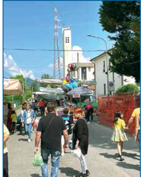
2ND OF JUNE FAIR IN FORNACI

Food, clothes, shoes, household goods and many other items for hobbies and free time.