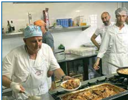
CASTELVECCHIO VILLAGE FESTIVAL

The Barga-Scotland connection has been celebrated in this way for years. Many Barga people made their fortune in Scotland by opening up or running fish & chip restaurants or take-aways and thanks to this dish so strongly connected to Barga emigration, AS Barga organise this Festival every year. Succulent Fish & Chips cooked and served according to the original recipe. Also gluten-free fish and chips. Every evening dancing with live music. It is possible to reserve a table at 338 2386840