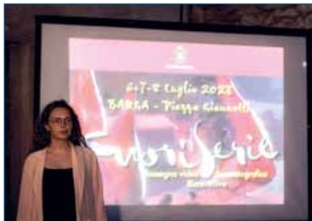
FUORI SERIE

The association "Uno Spazio per te" organises the event "A Room for the Writer". An original moment to give the possibility to writers of the Province of Lucca to present their publications starting from late afternoon at 18 with gastronomy, handicraft and recycle stalls.