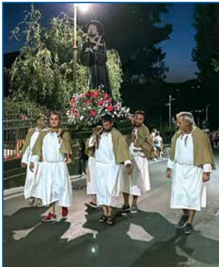
PROCESSION OF SAINT FRANCIS OF ASSISI