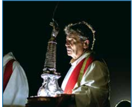
THE "ARM" OF SAINT CHRISTOPHER