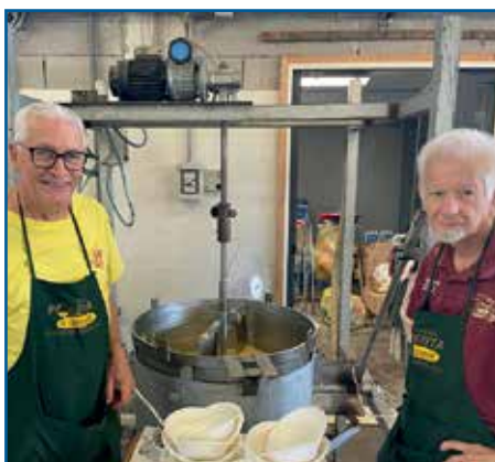
POLENTA AND BIRD FESTIVAL IN FILECCHIO

The main dish is the delicious Garfagnana Polenta "otto file" that is accompanied by birds, cheeses and other specialities. On the 6th September the traditional evening dedicated to pork shank.