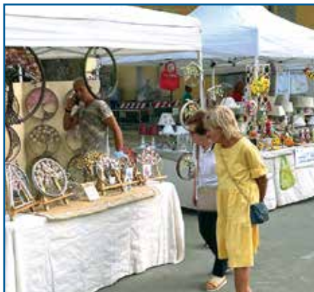
HANDICRAFT MARKET IN BARGA

The traditional and secular Barga Fair in Barga Giardino from 15th to to the morning of 17th August. Hundreds of stalls where you can find a wide range of goods at excellent prices at the hundreds of market stalls. A must are the garlic and watermelon stalls. It is an important appointment for all the local Barga people, an occasion to meet up and have a chat after the religious ceremonies held on the 15th at the Fornacetta Church and on the 16th and 17th at San Rocco Church. There will also be dancing in the square on the evenings of 15th and 16th August organised by the Town Hall.