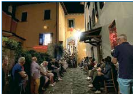
CONCERTO ALLA FINESTRA