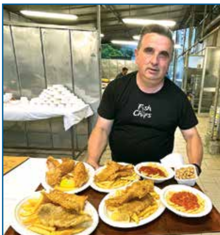
"FISH AND CHIPS" FESTIVAL